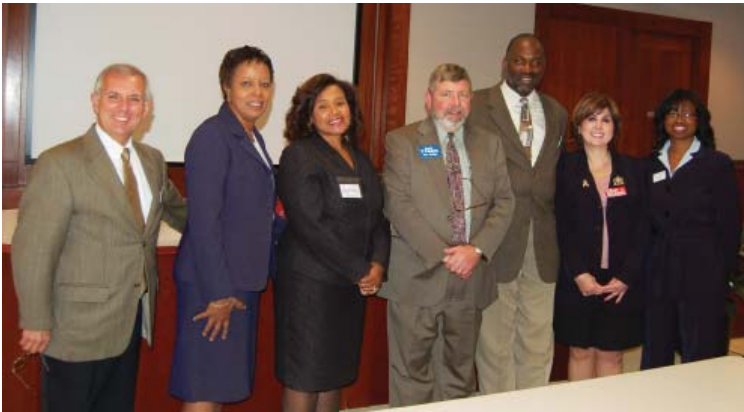
Franklin County Municipal Court Judicial candidates pose for a quick photo op before discussing their platforms at the October General Membership meeting.